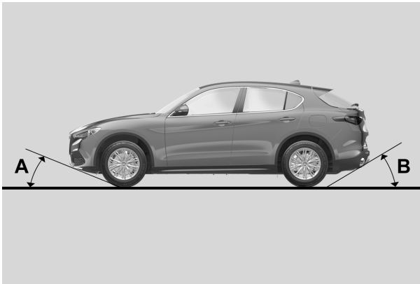
Front And Rear Loading Angles

The following image illustrates the front and rear attachment corners of the vehicle, to be taken into consideration when loading the vehicle on the commercial towing vehicle.