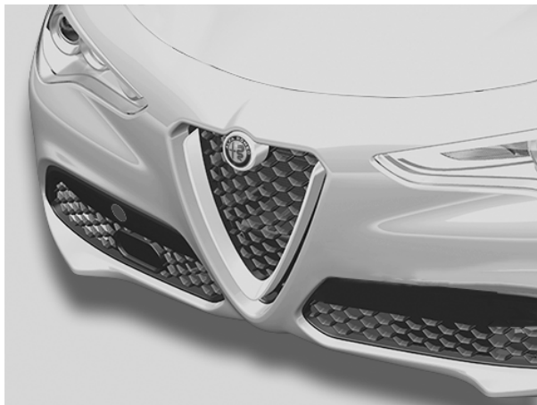
Front Tow Eye Cap