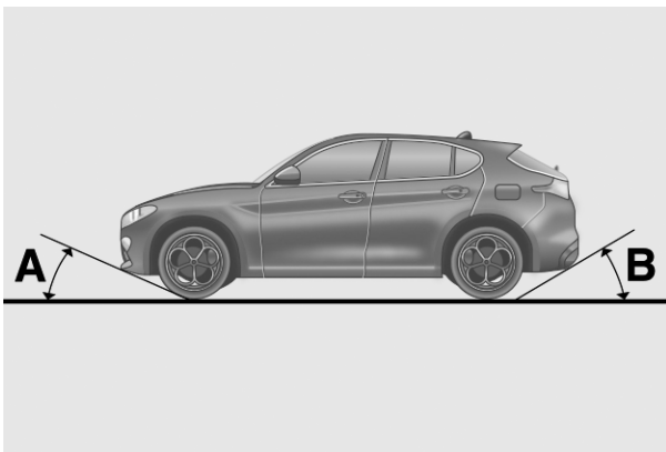
Front And Rear Loading Angles