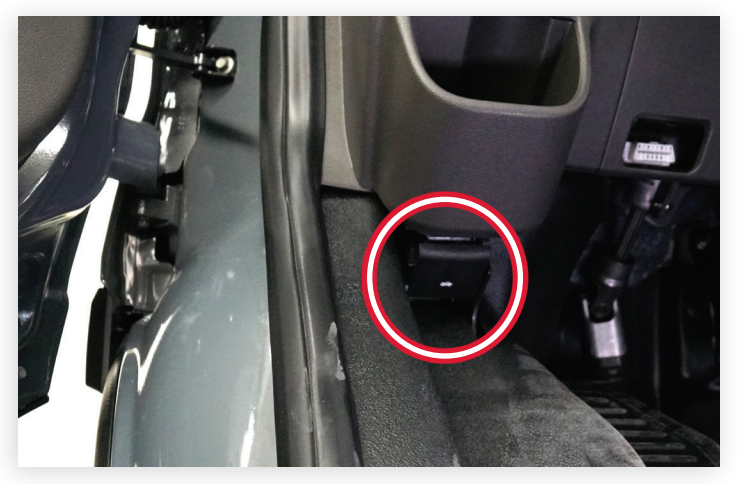
Hood Release is in Driver Side kick panel