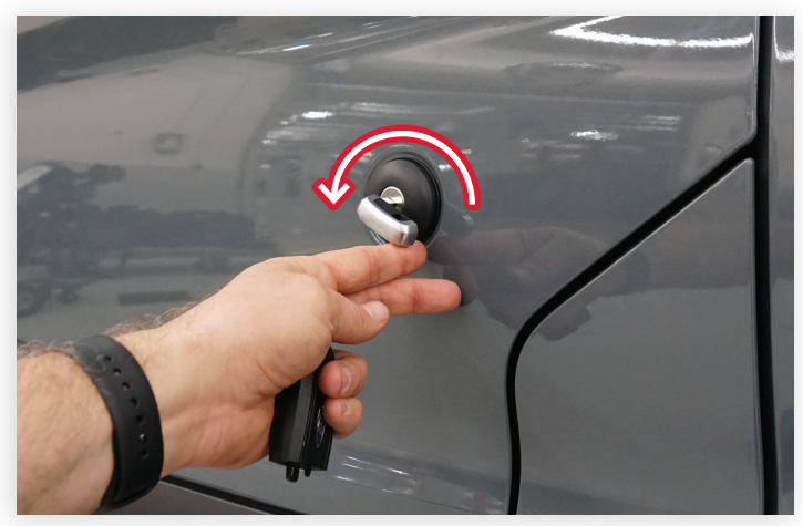
Insert Key Blade in Lock Cylinder Rotate Counter Clockwise, pull handle to open