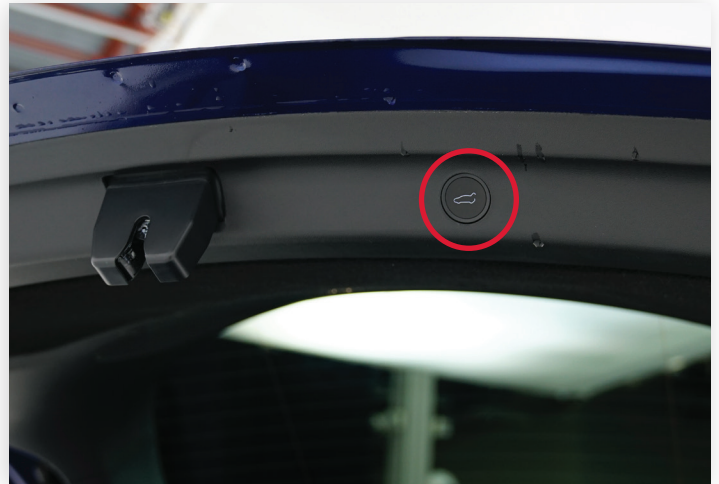
Interior Trunk Close Switch powered rear trunk