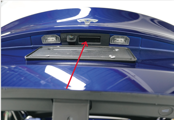
Exterior Rear Trunk Switch