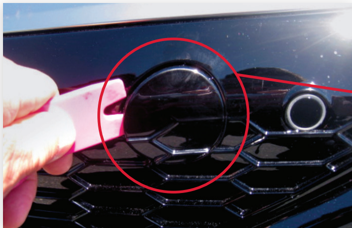
Remove cover from front bumper with plastic trim device