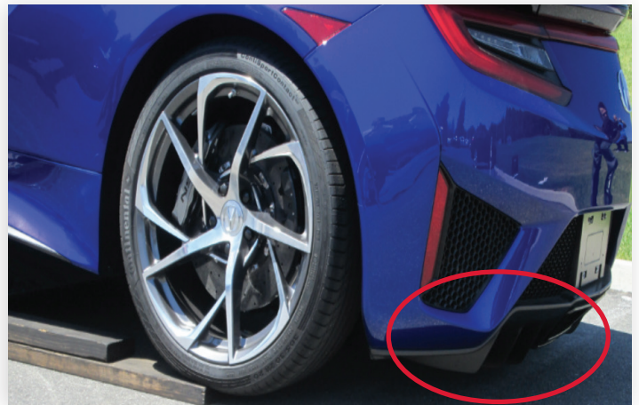
Caution while loading onto flat bed