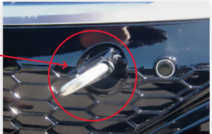
Tow eyelet inserted into front bumper location