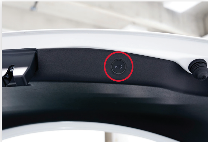
Interior Trunk Close Switch powered rear trunk