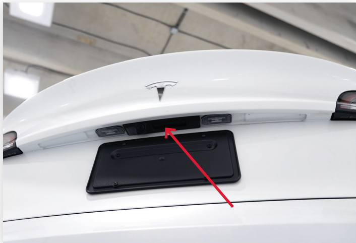
Exterior Rear Trunk Switch