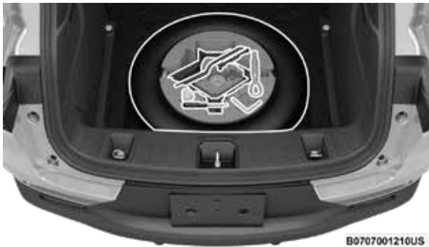
Jack, Tools And Spare Tire Location

If equipped, the jack, tools and spare tire are located under the load floor in the rear cargo compartment.