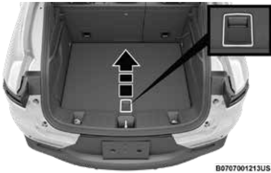
Load Floor Handle