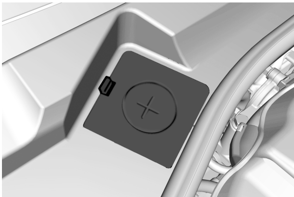
Protective Cowl Cover

The remote positive (+) post is located at the rear of the engine compartment, which can be accessed by removing the cowl cover, and opening the spring loaded protective flap.