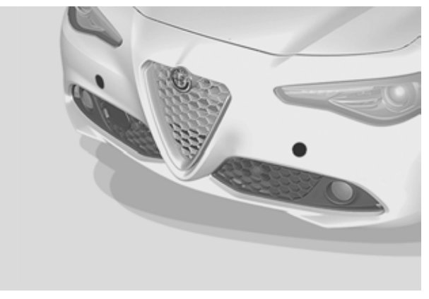
Front Tow Eye Cap Locations

1. Unhook the cap on the front (left or right side) or rear fascia/bumper, pushing on the upper part.