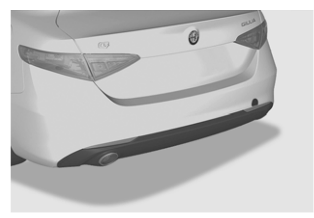
Rear Tow Eye Cap Location